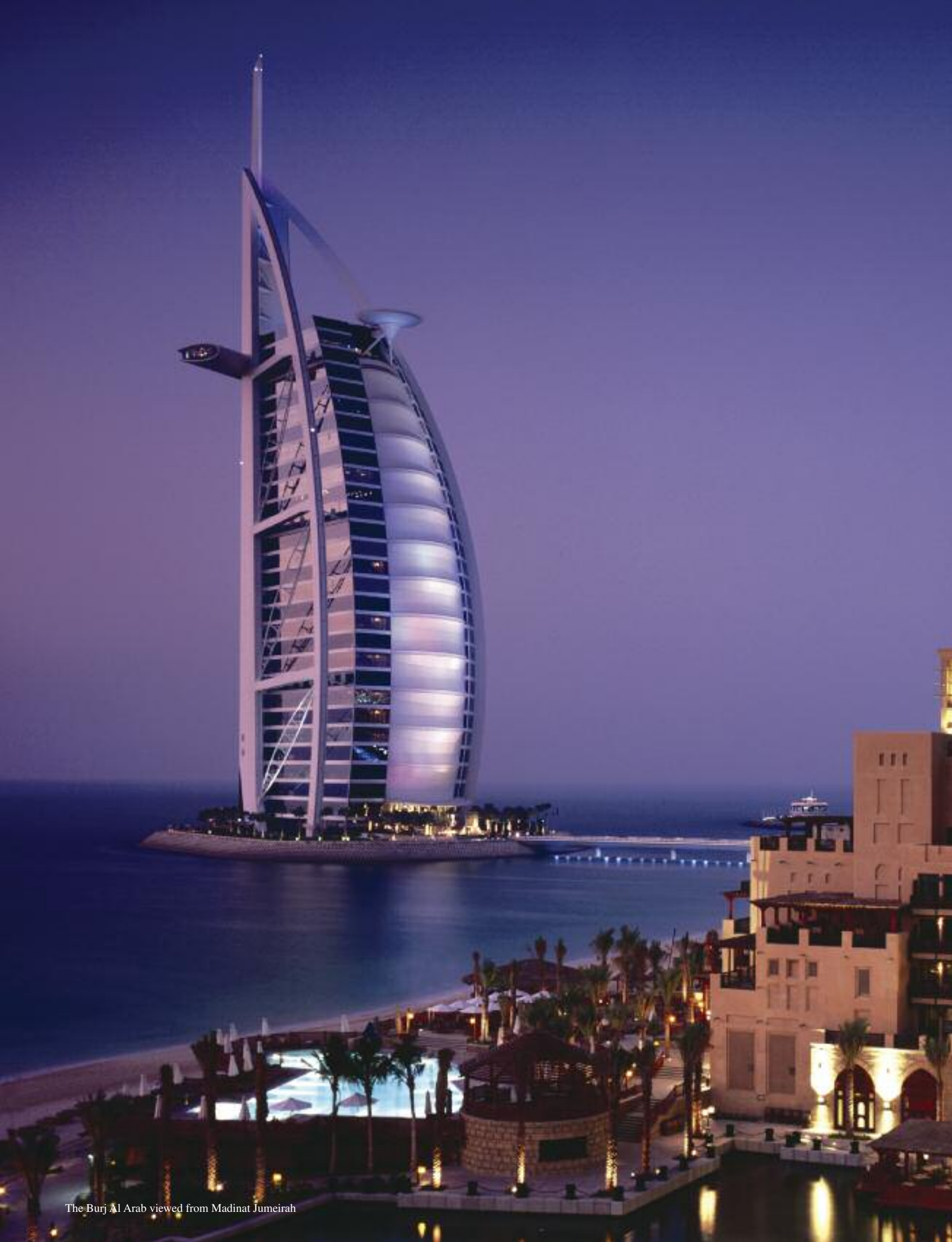
The Burj Al Arab viewed from Madinat Jumeirah