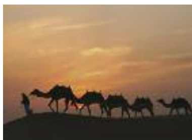
Bab Al Shams Desert Resort & Spa