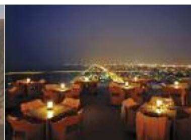
Jumeirah Beach Hotel