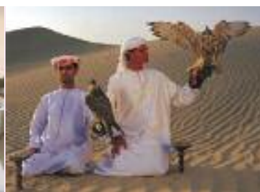
Bab Al Shams Desert Resort & Spa