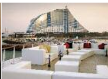
Jumeirah Beach Hotel