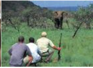
Kwa Maritane Lodge