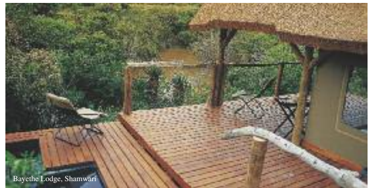
Bayethe Lodge, Shamwari