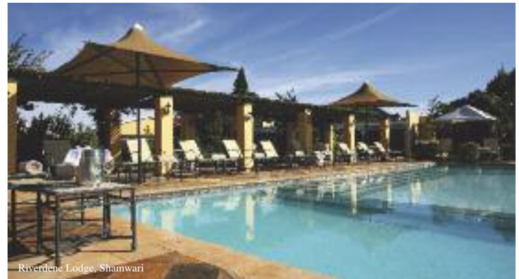
Riverdene Lodge, Shamwari

Please enquire regarding Shamwari’s alternative Lodges (which only accept adults or children age 12 plus).