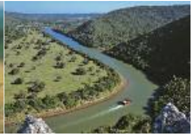
Kariega Game Reserve